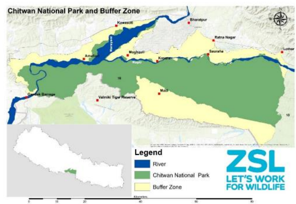
food (fish) and water. The project also supports indigenous fish dependent communities to

This project aims to reverse the current rate of decline in the gharial population through: robust monitoring of the river ecosystem and gharial population; providing knowledge for the formulation of a river ecosystem management plan; increasing river protection through forming communitybased protection units; and enhancing the effectiveness of the Gharial Conservation Breeding Centre (GCBC). By restoring the ecosystem health of Narayani and Rapti rivers, the project aims to deliver positive benefits to the local communities dependent upon these river ecosystems for